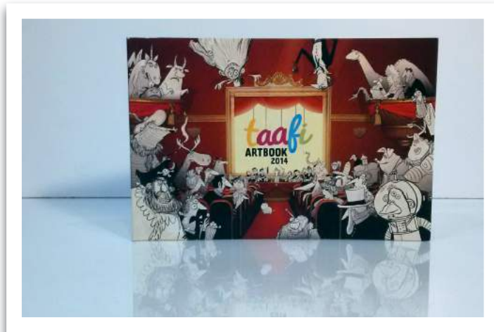
TAAFI Art Book - 2014

Added bonus: If someone misses you at the event, they won't miss you or your contact info in the TAAFI Art Book. It will live on as a reminder of some of the great artists, students and exhibitors that took part in the best year of TAAFI yet!