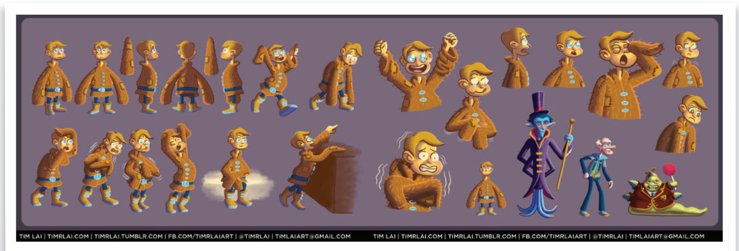
TAAFI Art Book - Full Two-Page Spread Sample